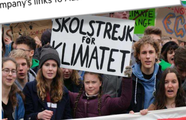
Climate activist Luisa Neubauer, grey hat, with Greta Thunberg, centre

Move comes as protests mount over company's links to Australian coal mine